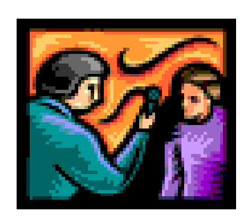
The Board answers your questions.

with contact lenses and the doctor can write the CTL Rx. The CTL issue date should be at the conclusion of the design, fitting, and management period; this should be within 90 days. The recommended expiration of the CTL Rx is 1 year unless the patient has a health concern that necessitates a shorter expiration date. The reasoning must be documented in your records. (Ex: corneal vascularization or GPC).